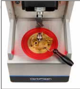
Optical fire detecting system covers entire hot area